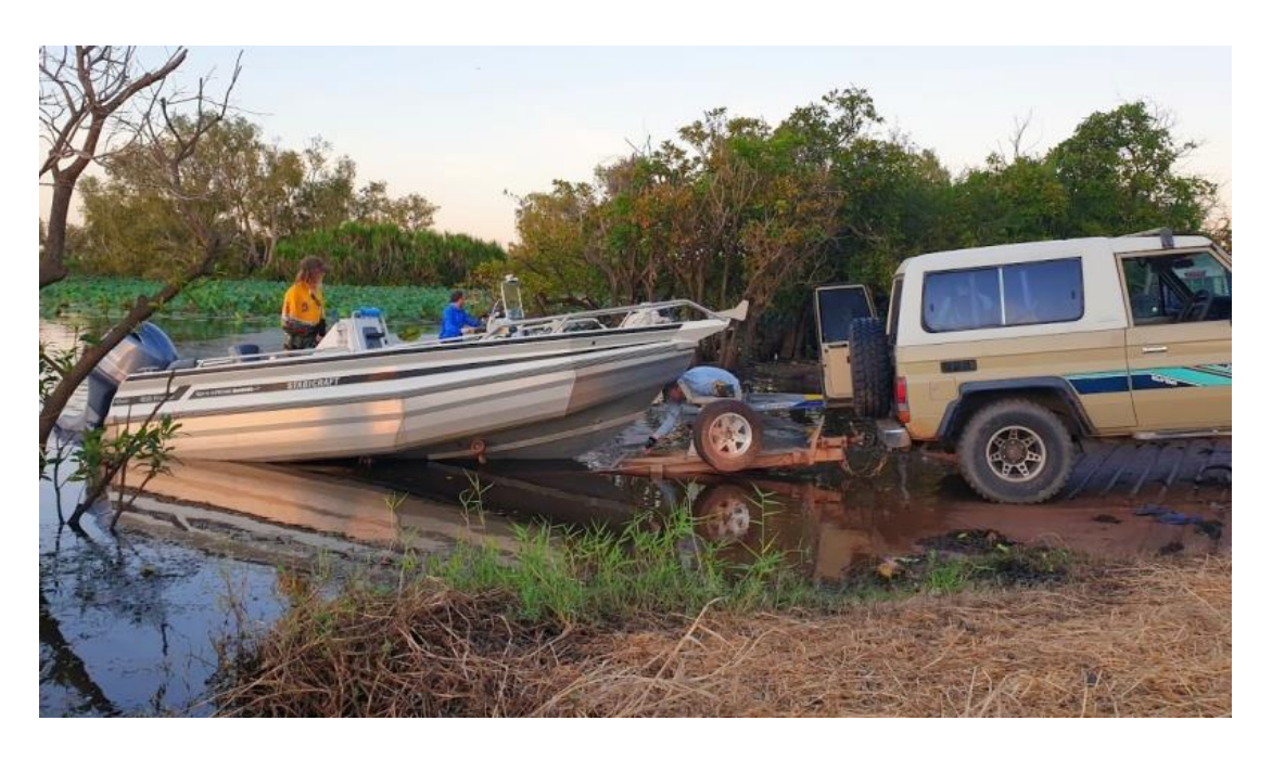
Launching early morning at a busy Corroboree boat ramp