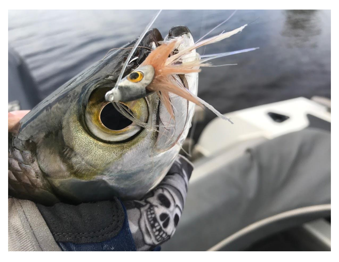
Death grip tarpon